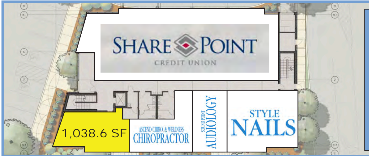
Office/Professional Bldg. First Floor Plan

Highway 13 & Nicollet Avenue | Burnsville, MN, 55337