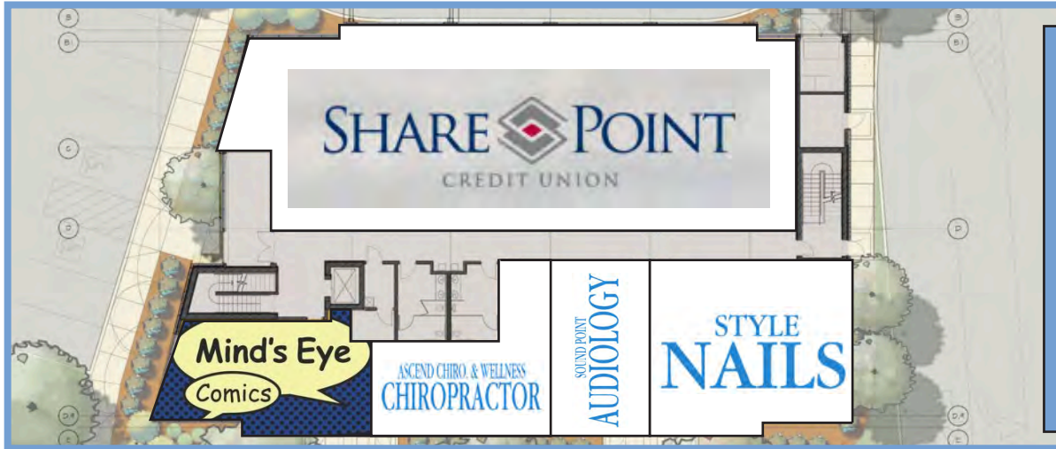
Office/Professional Bldg. First Floor Plan

Highway 13 & Nicollet Avenue | Burnsville, MN, 55337