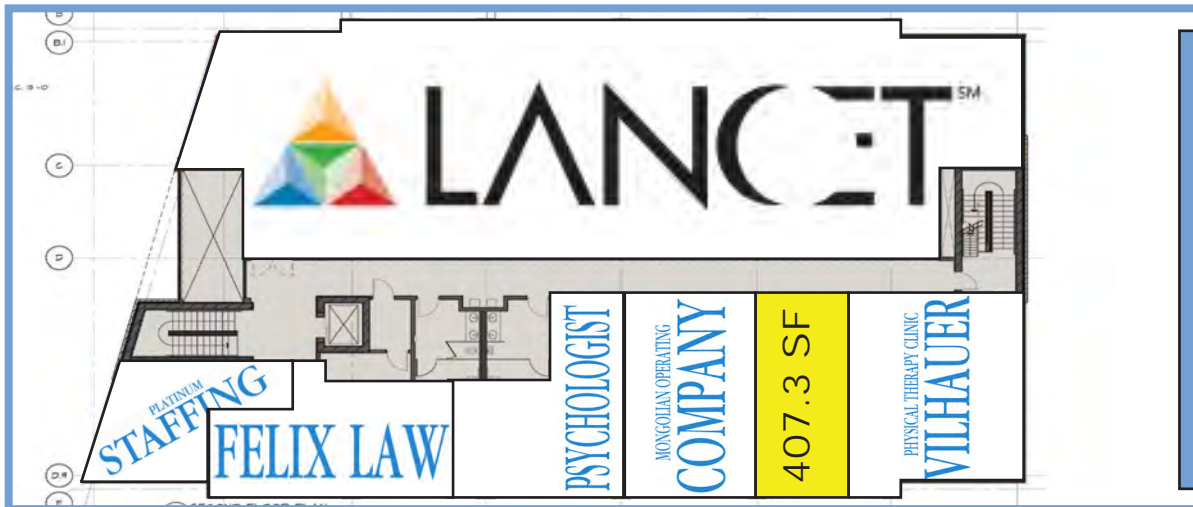
Office/Professional Bldg. Second Floor Plan